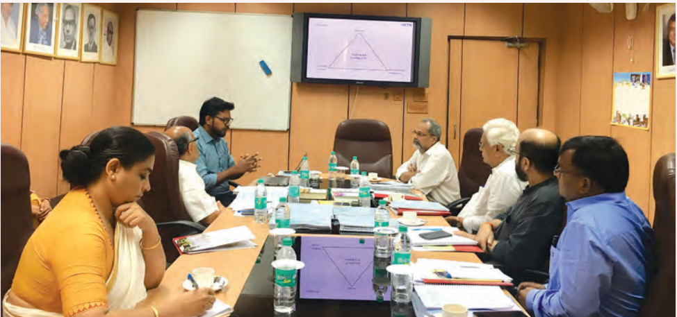
The Expert Committee Meeting of the Research Project on the 'Teaching and Learning in Indian Higher Education'