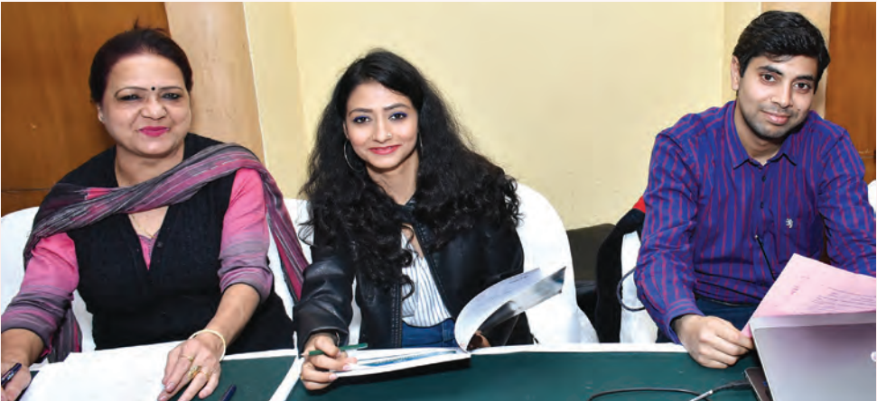
CPRHE Staff at the International Seminar