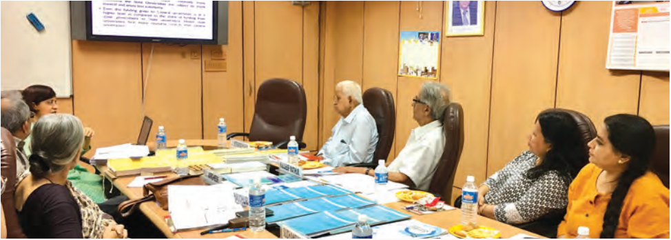
The Expert Committee Meeting of the Research Project on the 'Governance and Management of Higher Education in India'