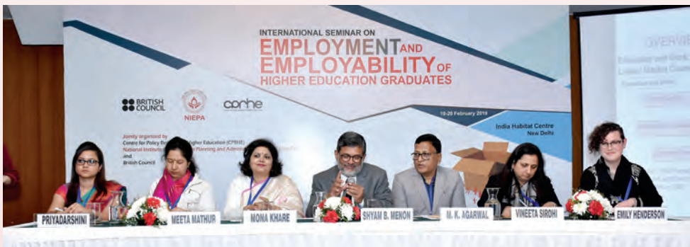
The CPRHE Panel at the International Seminar on 'Employment and Employability of Higher Education Graduates'

The Government of India has initiated various steps to make university graduates employable. The enrolments in B.Voc programmes have doubled in 2017-18; seven skill universities are operating; several universities have started apprenticeship programmes and are starting degree professional study programmes under the scheme of Higher Order Skills for Higher Education (HOSHE). These efforts to have add on skills to the students of Bachelor of Arts, Science and Commerce graduates will be offered by providers in higher education institutions.