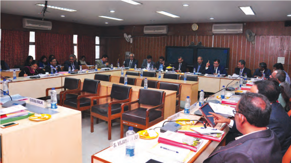
Meeting of the State Councils of Higher Education