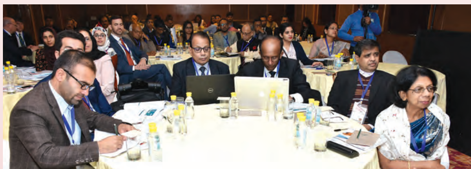
Delegates of the International Seminar on 'Employment and Employability of Higher Education Graduates'

The youth unemployment is on the rise. The global unemployment among youth is more than 200 million and is expected to increase to 212 million by 2019. According to ILO estimates which take into account new labour market entrants, an additional 280 million jobs need to be created to close the global employment gap by the end of this decade. More importantly, a good share (45%) of the additional job seekers in this decade maybe from East and South Asia regions. The situation becomes aggravated since the vulnerability of the employed and informal rate of employment is very high in many of the countries of the same region. In the absence of stability in employment and well developed social security support systems, even the employed are becoming increasingly vulnerable.