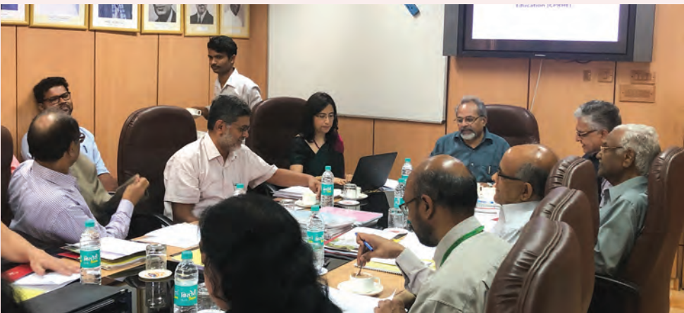
Executive Committee Meeting of the Centre for Policy Research in Higher Education