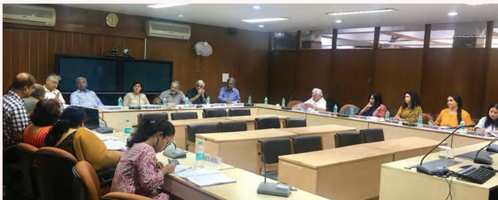
Second Peer Review Meeting of the Authors of the IHER 2019

The fifth India Higher Education Report 2019 (IHER 2019) focuses on 'Governance and Management of Higher Education'. The Centre developed a concept note for the IHER 2019, identified the prospective authors of different chapters and requested them to send the abstracts of the chapters ( List of authors is attached in Annexure III ). The first Peer Review Meeting to discuss the framework and individual chapters based on the abstracts was organised on 4 May, 2018. The authors developed their chapters, and a second Peer Review Meeting of the authors of the IHER 2019 was held on 27 September, 2018. The CPRHE prepared extensive review comments and shared among the authors for revision of their papers. The report is under-preparation and will be published by Sage. CPRHE also plans to prepare the next issue of India Higher Education Report 2020 (IHER 2020) on the theme 'Employment and Employability of Higher Education Graduates'.